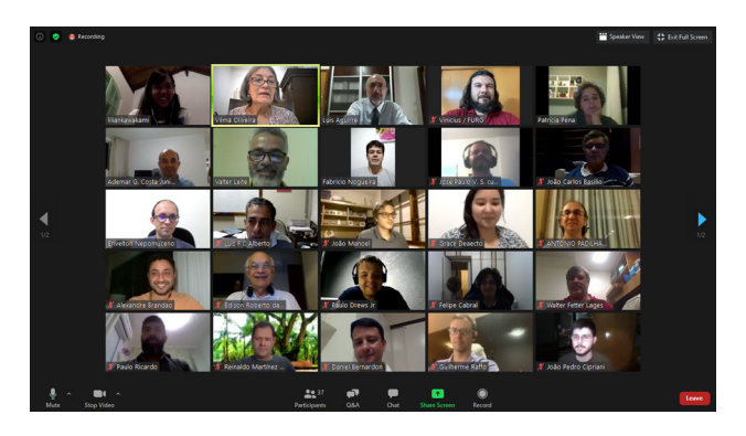
Fig. 2 SBA general assembly during the CBA 2020